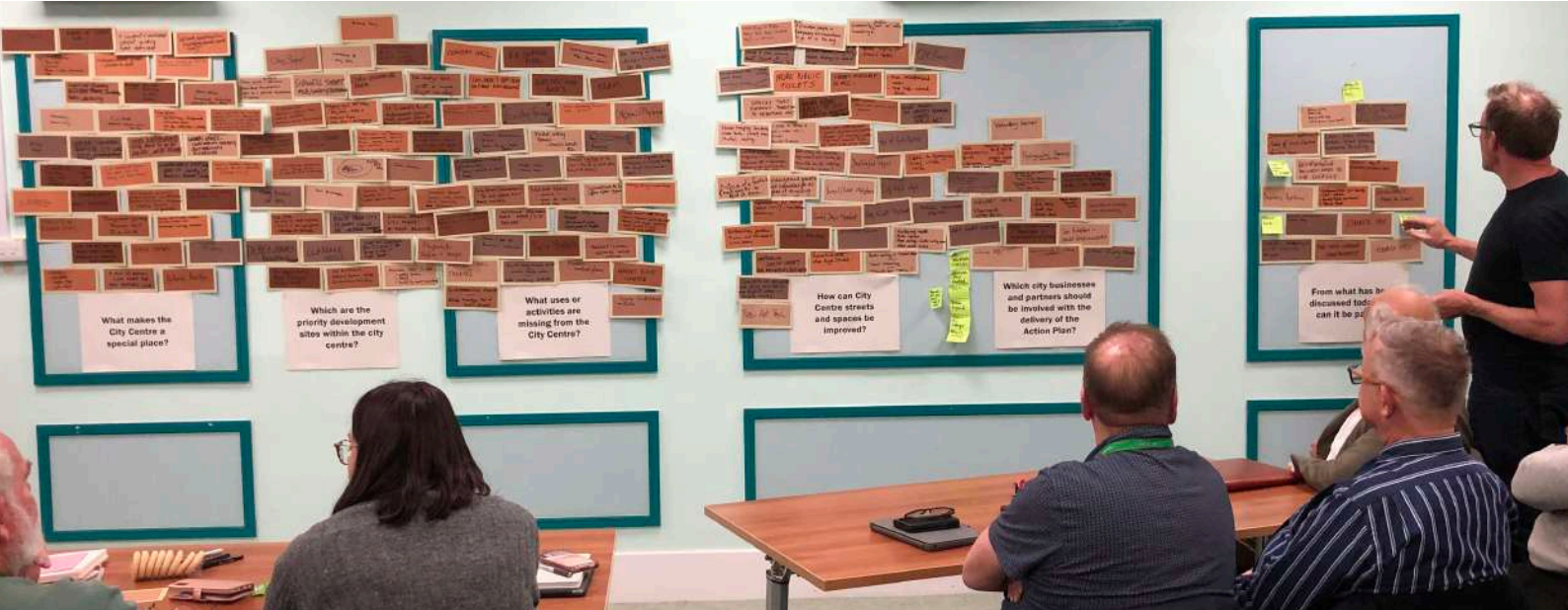
Photographs of building the wall built at the workshop, November 2024

Which are the priority development sites within the city centre?