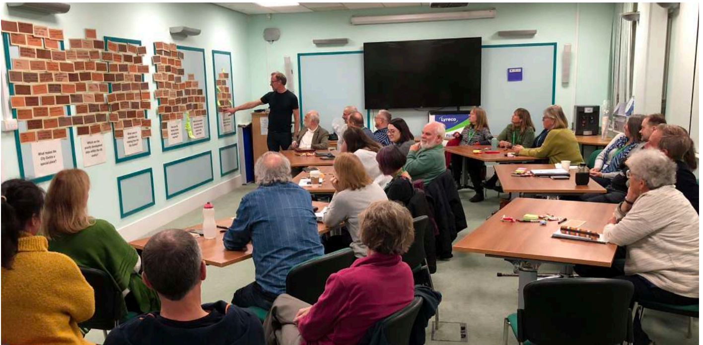
Councillor's Workshop November 2024