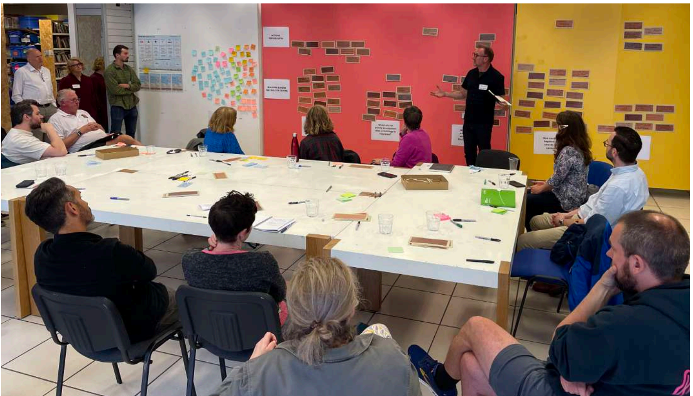
Stakeholder Workshop July 2024