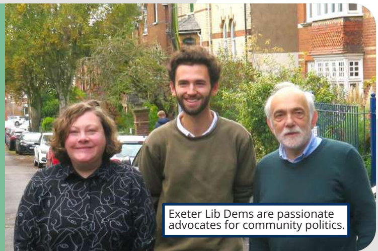
Exeter Lib Dems are passionate advocates for community politics.

Lib Dems want to ensure the benefits of a growing city are shared with every community. We would ensure money from developer levies gets redistributed to rejuvenate Exeter's neighbourhoods, particularly the most deprived areas.