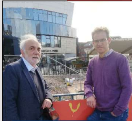
Labour's city centre vanity schemes have cost £50m+ and decimated council finances.

Focusing on getting the basics right would free up resources to deliver more effective safety, environmental and affordable housing schemes.