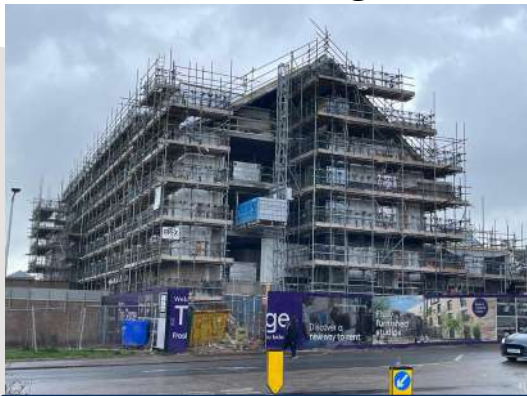
The Gorge - the only co-living block in Exeter to date. It still has many empty rooms.

But 'co-living' blocks do. These rooms are cramped and unaffordable. They do not provide the long-term housing solution young people in Exeter desperately need. Developer levies should instead incentivise building decent, affordable and environmentally-sound homes. This will help people save on running costs too.