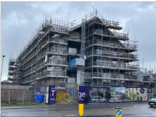
The Gorge - the only co-living block in Exeter to date. It still has many empty rooms.

Purpose built student accommodation no longer receives a discount but 'co-living' blocks do. These bedsits are yet more cramped and unaffordable student blocks in another name. We need a mix of homes to reflect our diverse communities.