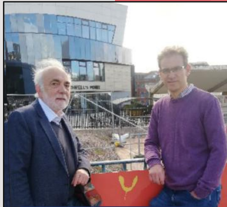
Labour's city centre vanity schemes have cost £50m+ and decimated council finances.

Focusing on getting the basics right would free up resources to deliver more effective safety, environmental and affordable housing schemes.