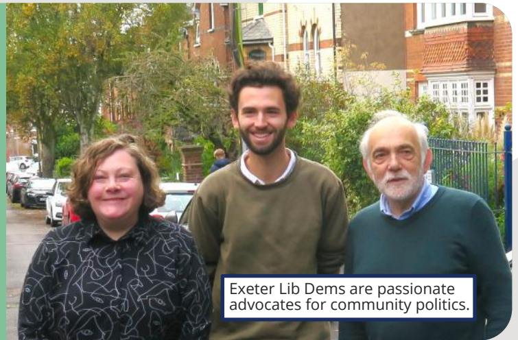
Exeter Lib Dems are passionate advocates for community politics.

Lib Dems want to ensure the benefits of a growing city are shared with every communities. We would set aside money from the Community Infrastructure Levy to rejuvenate Exeter's neighbourhoods, particularly the most deprived areas.