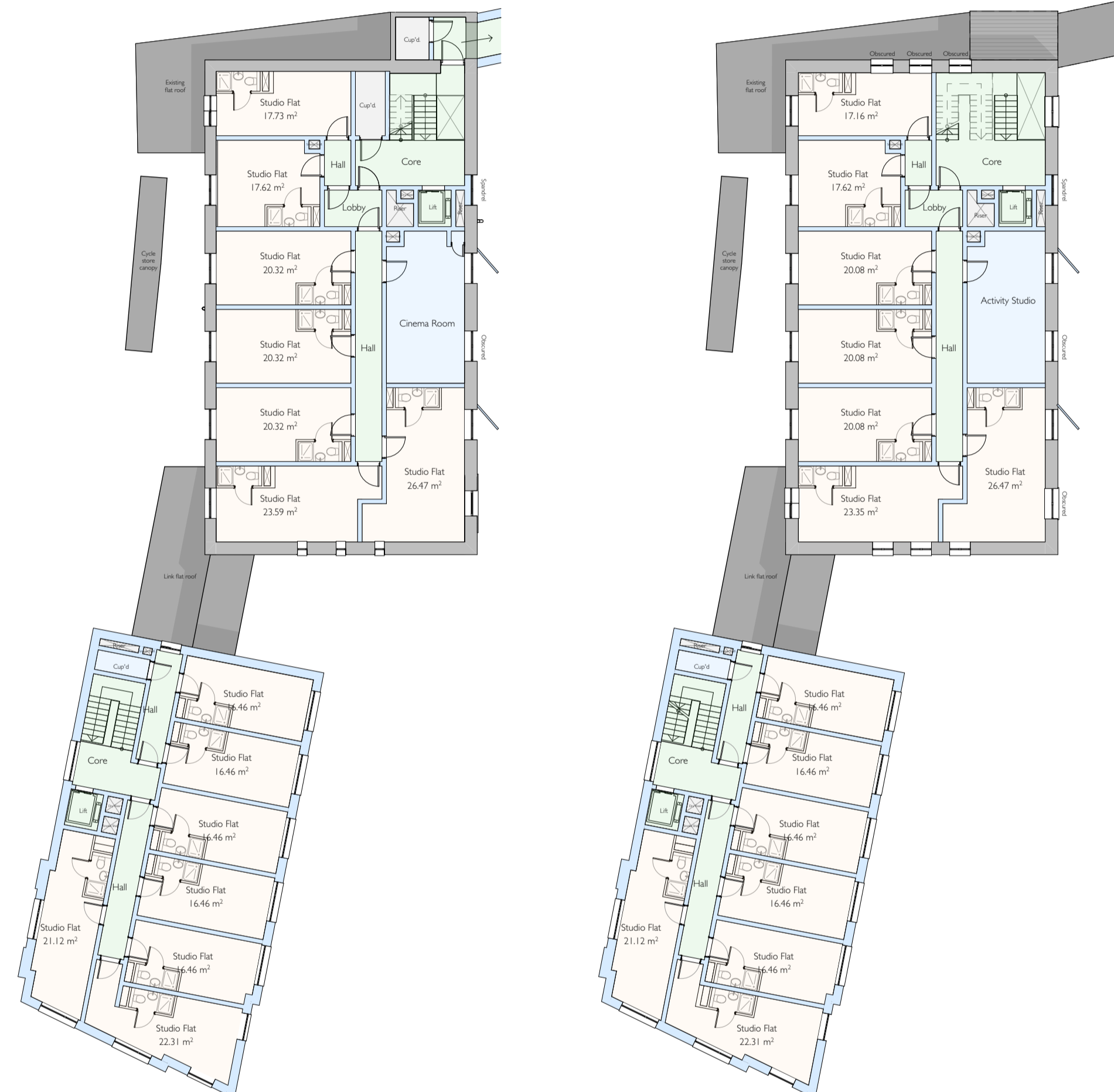
Proposed First Floor Plan Scale 1:200 @ A1