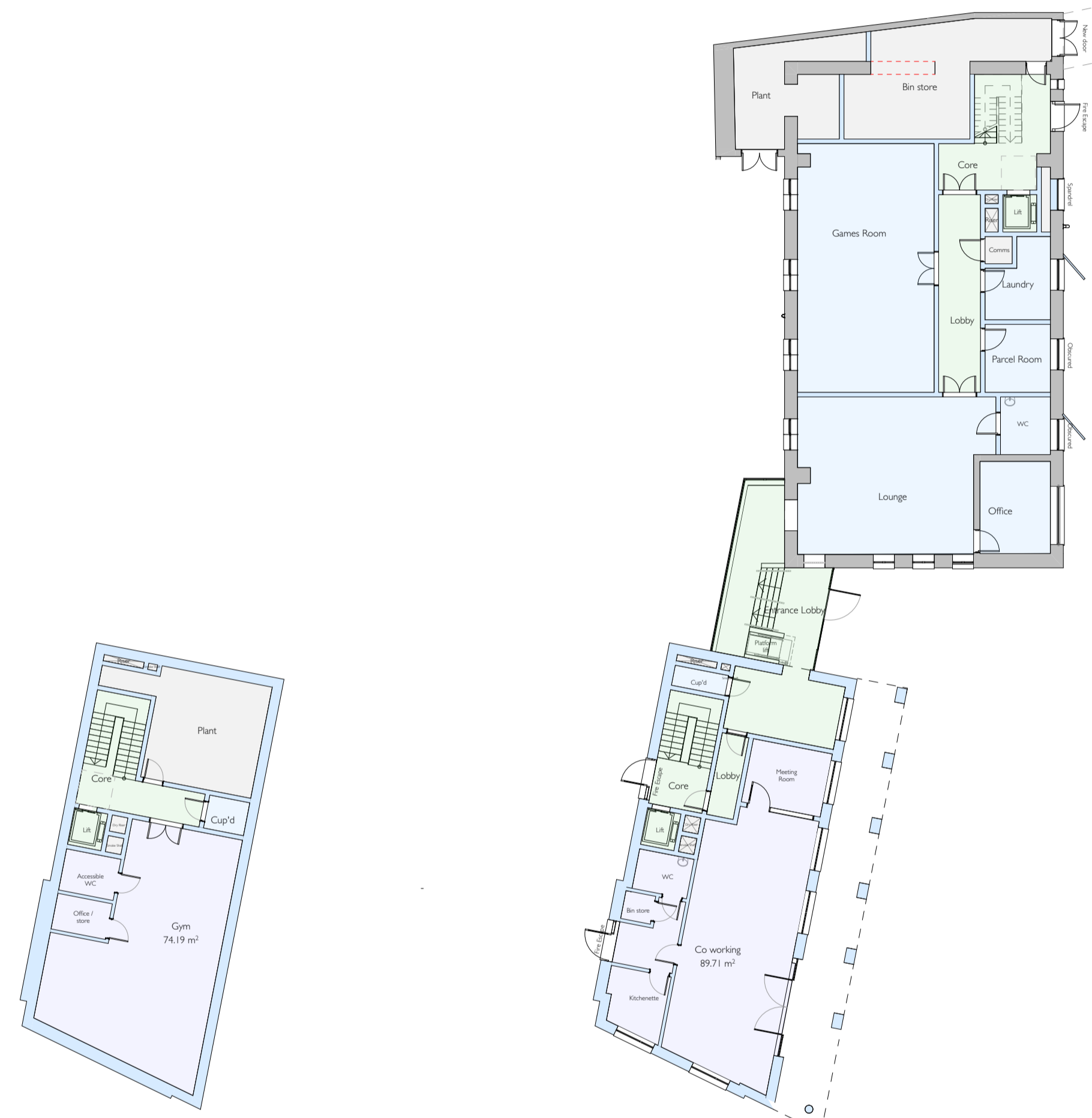
Proposed Basement Plan Scale 1:200 @ A1