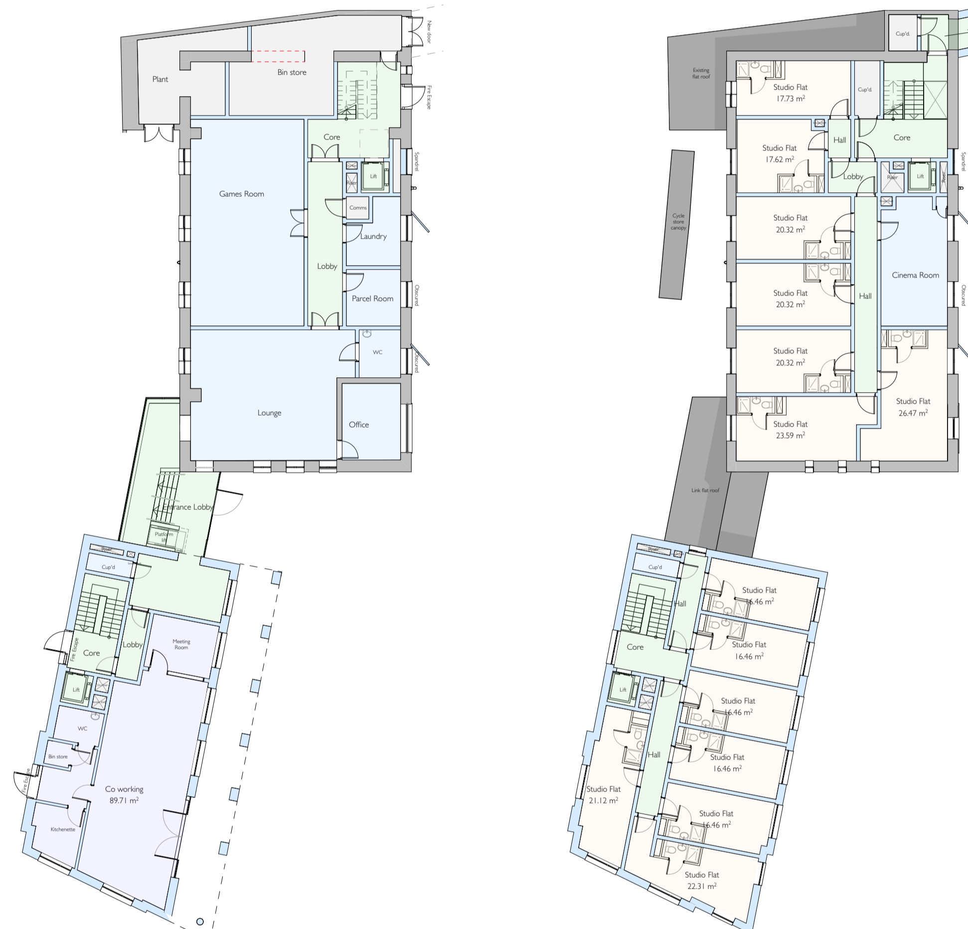
Proposed Ground Floor Plan Scale 1:200 @ A1