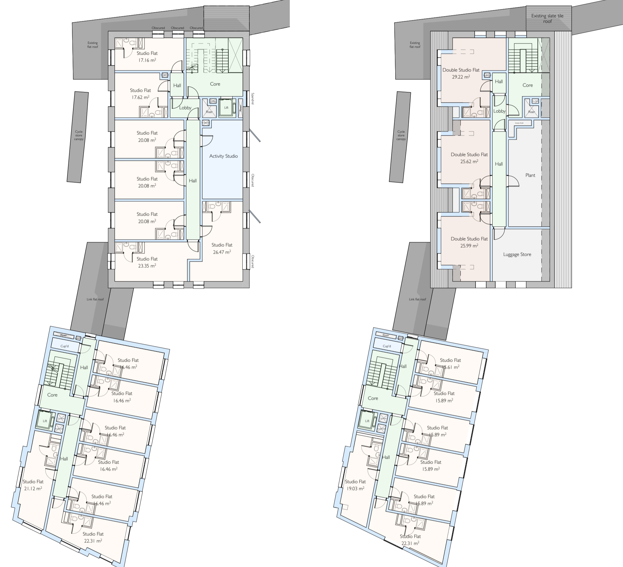
Proposed Second Floor Plan Scale 1:200 @ A1