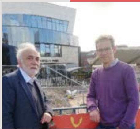
Labour's city centre vanity schemes have cost £50m+ and decimated council finances

Focusing on getting the basics right would free up resources to deliver more effective safety, environmental and affordable housing schemes.