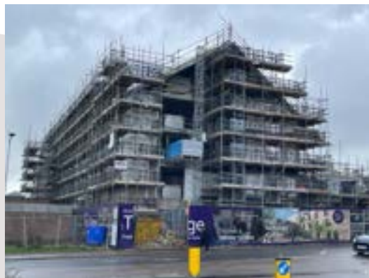
The Gorge - the only (partly built) co-living block in Exeter to date

Purpose built student accommodation no longer receives a discount but 'co-living' blocks do. These bedsits are yet more cramped and unaffordable student blocks in another name. We need a mix of homes to reflect our diverse communities.