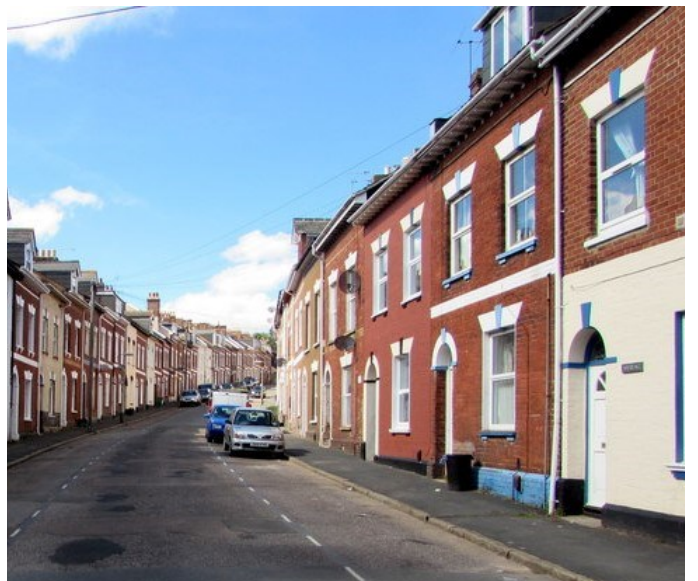
Most houses in this road pay no Council Tax and yet they expect their bins to be collected

All parties were asked to support our approach to the Government to get the legislation changed – Labour; Greens; Liberal Democrats did not do so. They are backing an unfair system.